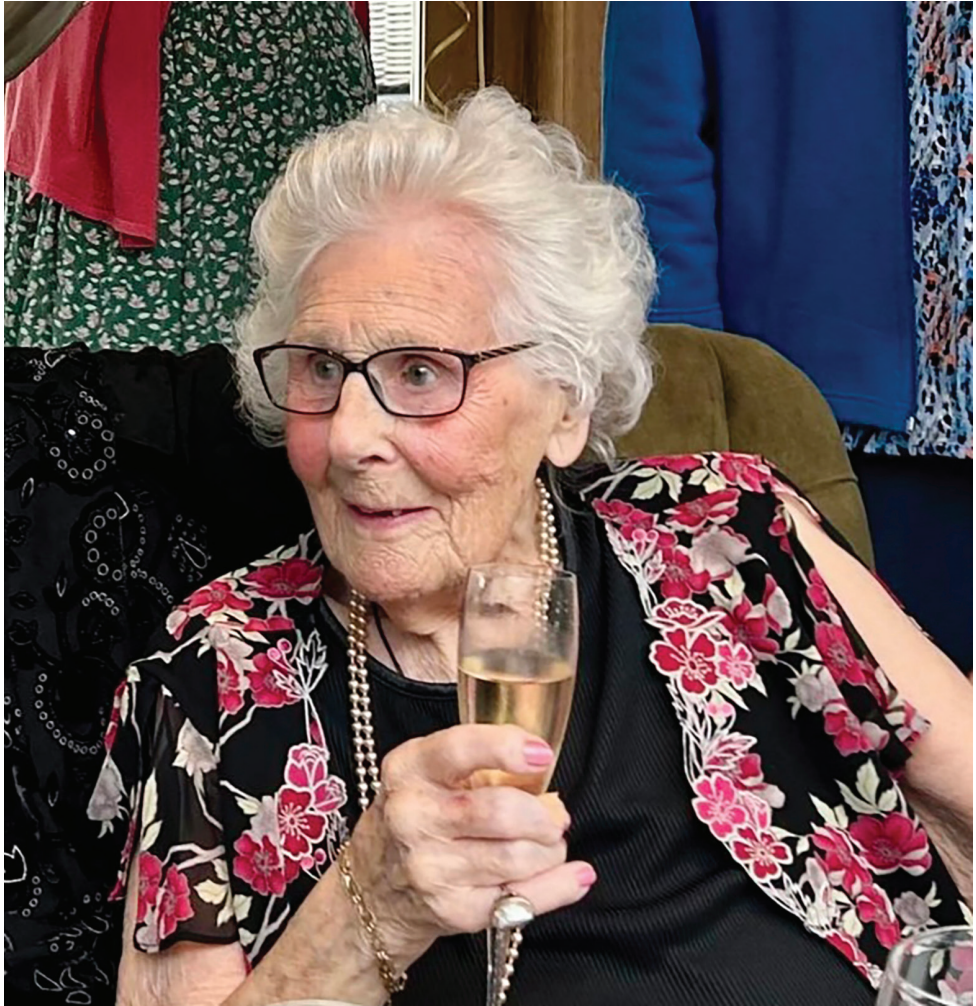
At her 100th Birthday Party 19 th August 2024