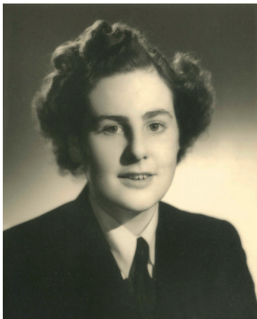
Engagement Photograph November 1945